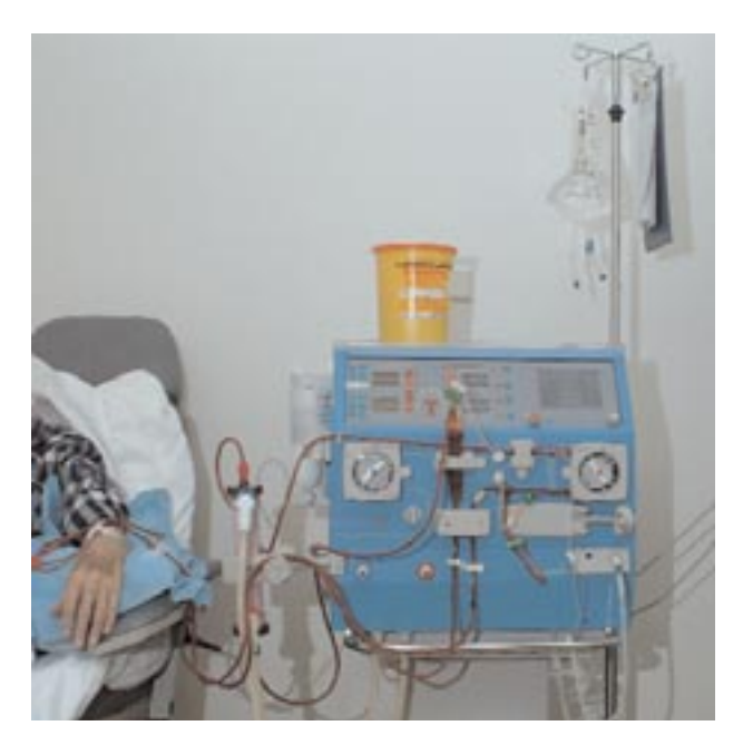
Fig. 1A. Intermittent hemodialysis, blood lines from the A-V fistula on the left forearm.

In all but one of the studies the anticoagulation efficacy was evaluated by clot formation in the dial-