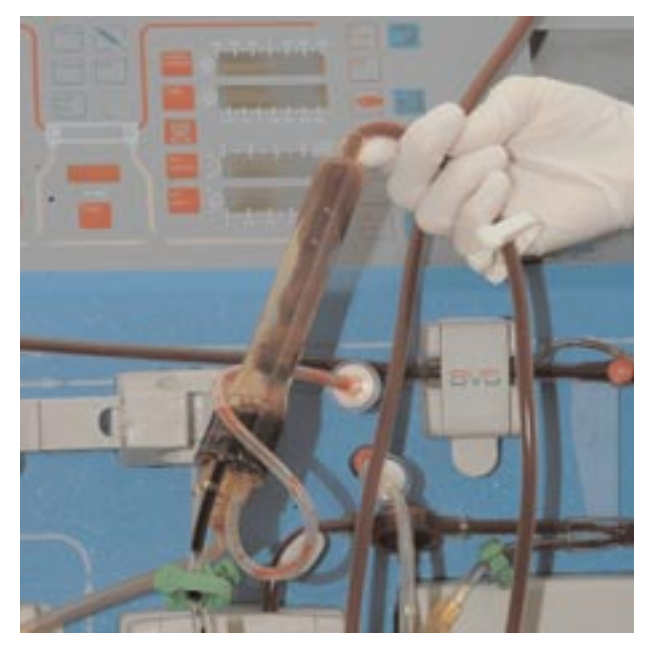
Fig. 1B. Clotting in the venous bubble trap inducing stop in dialysis in a patient at the end of a 4 hour hemodialysis session. The patient lost the blood volume in the filter and lines (about 200 ml).