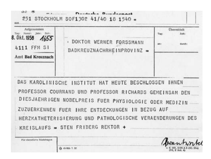
Fig. 6. Telegram of the Nobel price committee.

ly boundless. The celebrations were not solely restricted to coffee on that afternoon and the following evening.